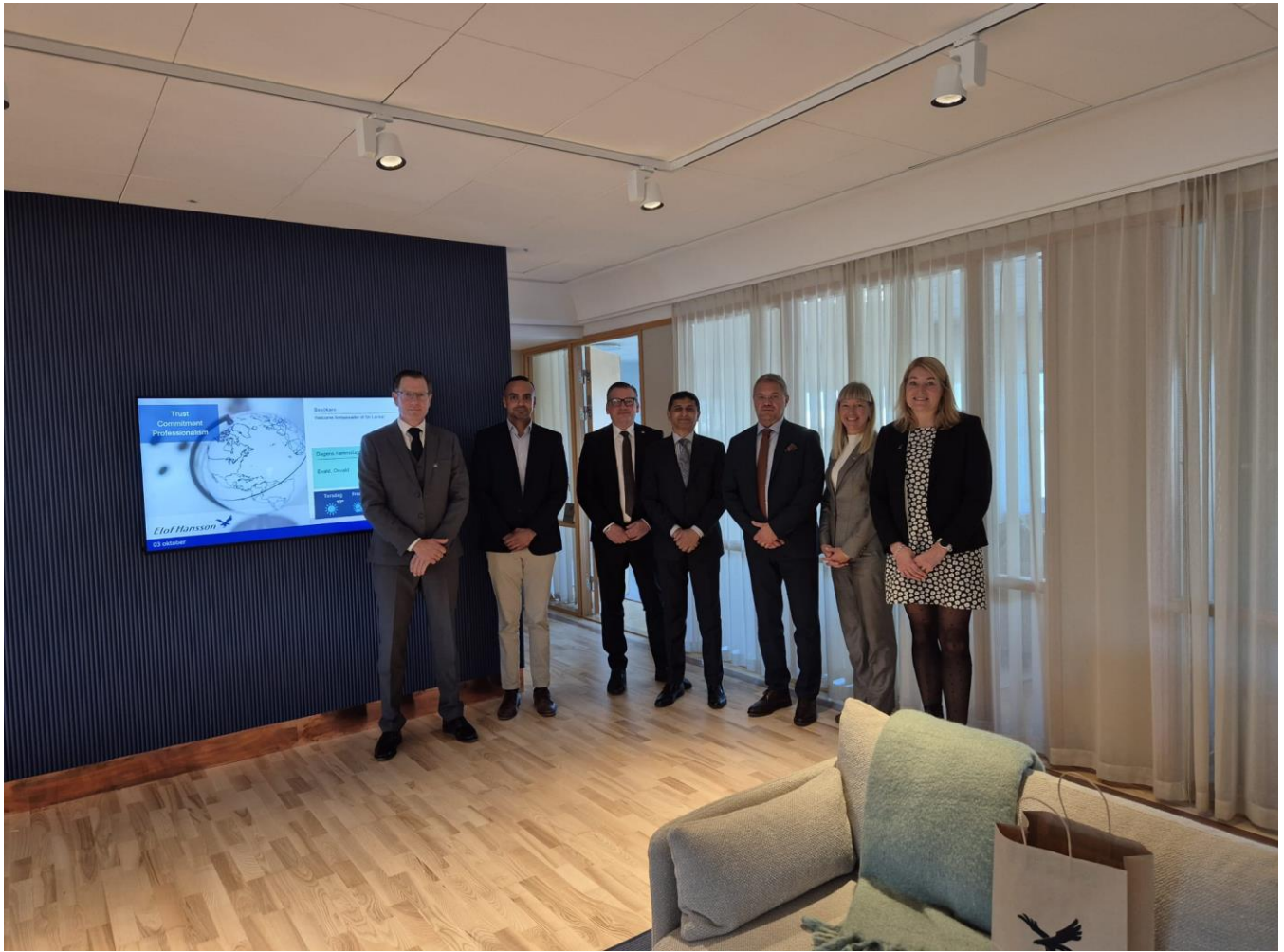
Ambassador's visit to Elof Hansson Group headquarters