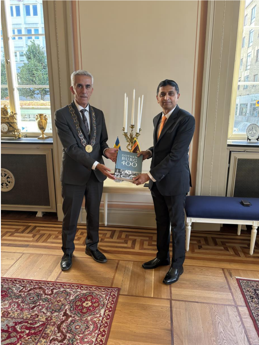
Ambassador's call on the Gothenburg Lord Mayor Aslan Akbas