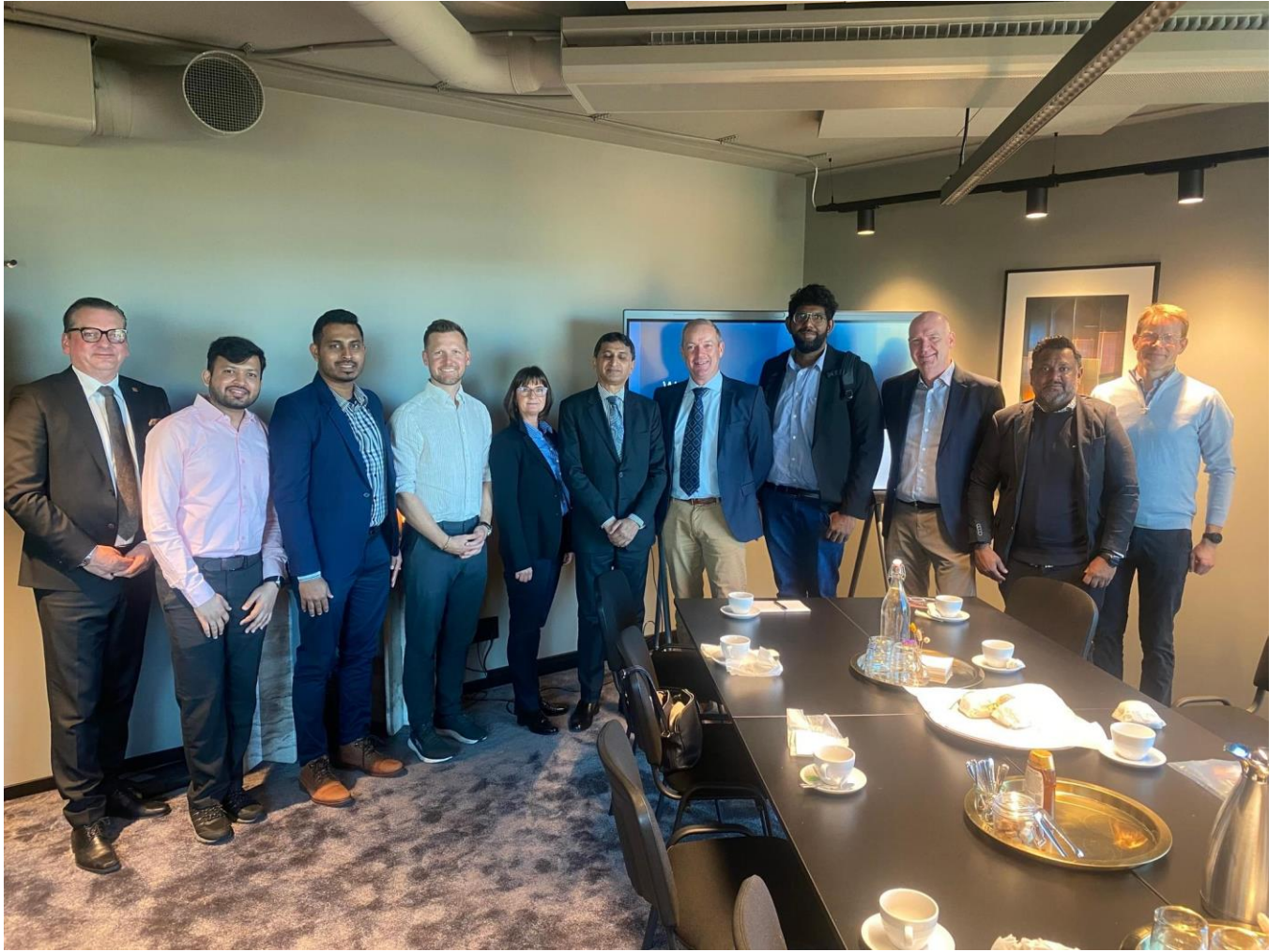
With the participants of the roundtable meeting organized by the Sweden Sri Lanka Business Council